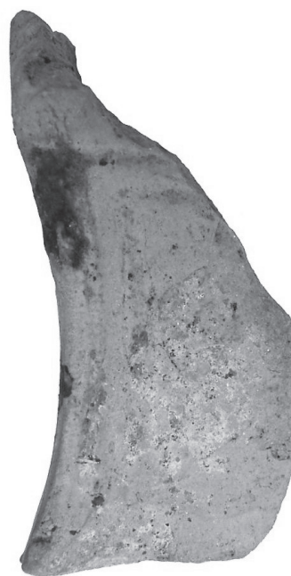
Fig. 2. Fragmentary statuette of a paredros (after ANGHEL et al. 2011, 54, Cat. Nr. 54)

Additionally, it is likely that some pieces had been manufactured in the same workshop, yet in different moulds. However, several common technical features are noticed in pieces from Apulum: the back of the chair has two bowing warps towards the heads of the characters, which form three knobs arranged along the edges and middle of throne's back; the male character is bearded, wearing a chlamys , and the female wears a semicircular tiara ; the presence of a knob in relief dividing into two the rendering area of the characters; the throne's armrest are „woven”.