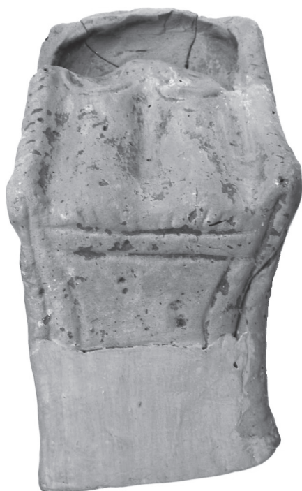
Fig. 1. Statuette of a paredros from a villa suburbana – south of Municipium Septimium Apulunse , west of Colonia Aurelia Apulensis (after ANGHEL et al. 2011, 55, Cat. Nr. 55)