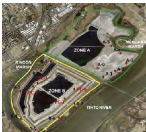
Phosphogypsum disposal site

The legacy site is located on a salt-marsh area, on the margins of the Tinto river mouth and actually is, from a radioactive point of view, not a closed system because it presents direct and diffuse pollution points (leachates) to the surrounding compartments mainly generated by rainwater and tidal influences.