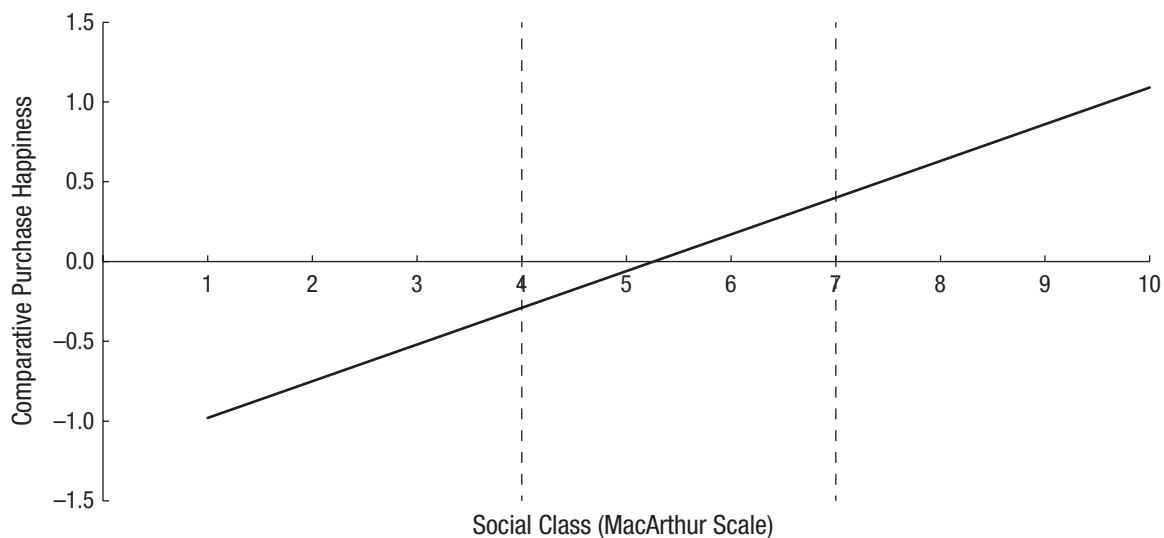
Fig. 1. Results from Study 1: mean comparative purchase happiness as a function of participants' social class. Positive numbers on the y -axis indicate experiential advantage, and negative numbers indicate material advantage. The dotted vertical lines indicate the points at which comparative purchase happiness was significantly different from 0. Social class was determined using the MacArthur Scale of Subjective Social Status (Adler & Stewart, 2007).

Social class predicts comparative purchase happiness. As hypothesized, a regression analysis predicting comparative purchase happiness from social class revealed that social class positively predicted happiness, b = 0.23 , t(207) = 3.39 , p = .001 (see Fig. 1). To interpret these results, we estimated the values at which happiness ratings significantly differed from the scale midpoint of 0, or equivalent happiness from the two purchases. Consistent