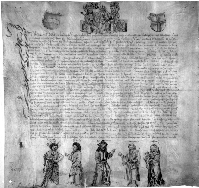
Fig. 7.3. The postenbrief of the Freiburg Meistersinger (original: Stadtarchiv Freiburg, A 1 XIII e V.2).