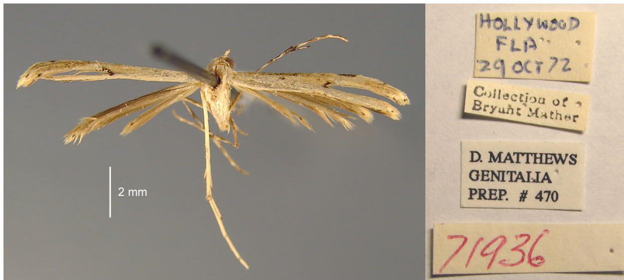
Figure 1. Adaina ipomoeae adult male from Florida, specimen labels on right.