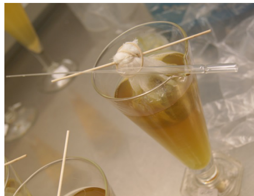
Figure 1. Photograph showing a conical Baermann glass with faeces wrapped in cheesecloth, submerged in 300 ml of tap water. On the top of the glass there is a 225 mm long Pasteur pipette used to obtain Strongyloides stercoralis larvae from the bottom of the glass.

All faecal samples collected in quarantine stations have been examined by using the formalin-ethyl acetate sedimentation technique (FEAST), a method used to concentrate protozoan cysts, coccidian oocysts, helminth eggs and larvae (including S. stercoralis ) (Allen & Ridley 1970, Young et al. 1979). For this purpose the Faecal Parasite Concentrator (FPC®) kit from Evergreen Scientific has been used. Since March 2012, all samples collected from dogs in quarantine stations have also been examined using a modified Baermann technique, a method based on the description of Henriksen (1965). Preferably 25-30 g fresh faeces is wrapped in a double (in the case of soft stool into a triple) layer of cheesecloth (absorbent gauze in rolls, Mullro®) and submerged into a 375 ml conical “Baermann” glass filled with approximately 300 ml of tap water (Figure 1). The sample is kept completely immersed in the water for 7-24 hours (usually overnight) at room temperature. Upon examination all sediment from the bottom of the glass is pipetted, put on one or more microscope slides, mixed there with a drop of iodine, and screened at 62.5x magnification in a light microscope for S. stercoralis first stage larvae (L1).