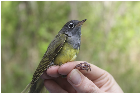
FIG. 1. Connecticut Warblers ( Oporornis agilis ) are arguably one of the most understudied songbirds to breed in North America. (Photo by K. Bell). [Color figure can be viewed at wileyonlinelibrary.com ]

within the expected nonbreeding range (Appendix S1). The fact that a recent capture of a single individual in Brazil was of scientific interest (Diniz et al. 2014) illustrates how elusive this species is outside of the breeding season. In effect, Connecticut Warblers have been “missing in action” for nearly all of fall migration as well as during the boreal winter.