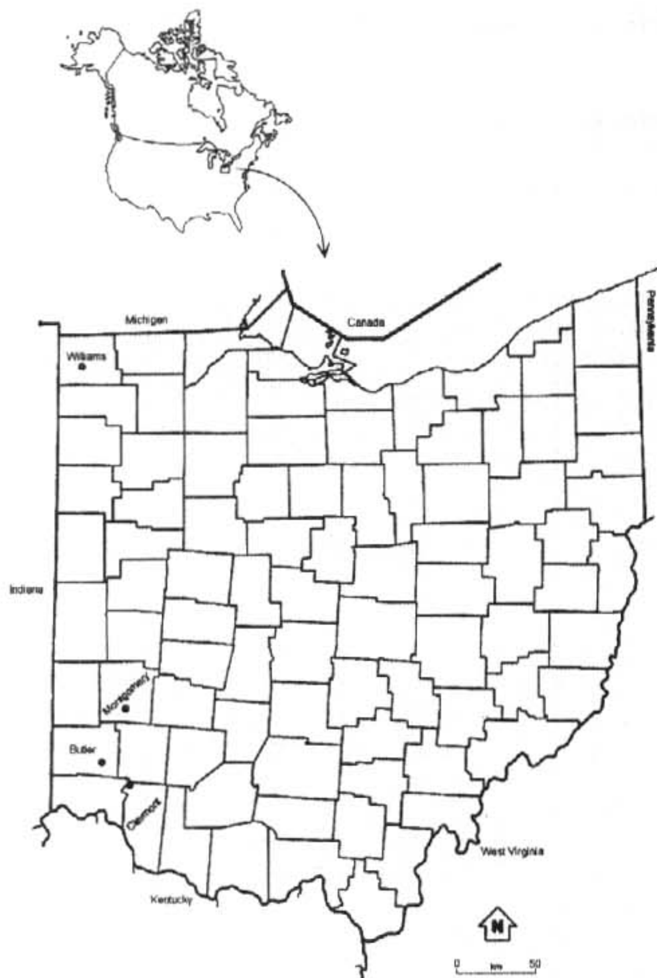
FIGURE 1. Blanchard's cricket frog collection locations in Ohio (filled circles).

anhydrous sodium sulfate, transferred to a 0.025 \times 0.60 m glass column and eluted with 320 ml 1:1 dichloromethane/hexane solution. The extract was concentrated to 2.0 ml by rotary evaporator then transferred to a 0.01 \times 0.55 m glass column containing 40.0 g activated florisil (60/100 mm mesh) for cleanup. The column was eluted with 50 ml hexane and the extract concentrated to 10.0 ml for gas chromatography. Chemical re-