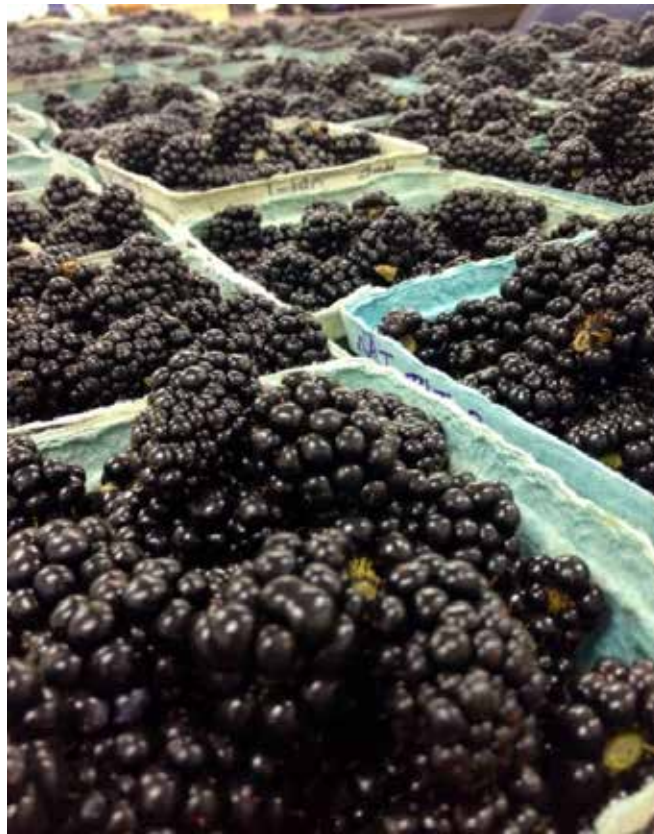
Fig. 2. Fruit harvests of 'Prime-Ark ® 45' blackberry as affected by seven shade treatments while grown in the field, at the University of Arkansas System Division of Agriculture's Arkansas Agricultural Research and Extension Center, Fayetteville, Arkansas, 2014.

Fruits were harvested beginning at 60 days after the onset of the experimental treatments. There was no apparent difference in the dates of first harvest among the treatments. Plants in the LS30 and LS50 treatments produced greater cumulative yield berry weight than ES30, MS30, and ES50 treatments, while all treatments were not different from the CK (Fig. 3). The cumulative harvested berry