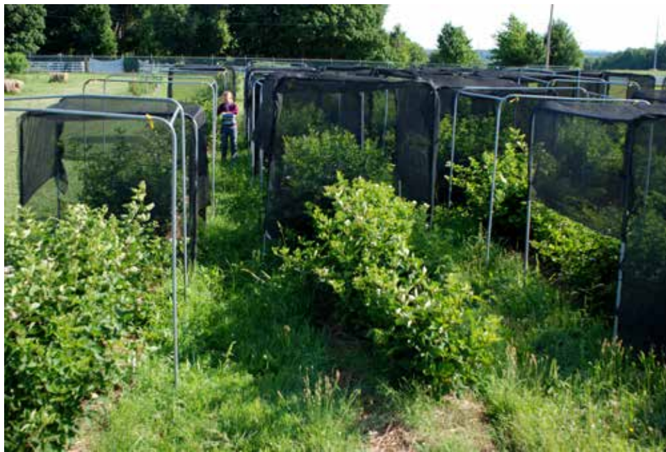
Fig. 1. Collecting CIRAS®-3 portable gas exchange monitor measurements after implementation of early shade (ES) and middle shade (MS) cloth of ‘Prime-Ark® 45’ blackberry as affected by seven shade treatments while grown in the field, at the University of Arkansas System Division of Agriculture’s Arkansas Agricultural Research and Extension Center, Fayetteville, Arkansas, 2014.

Plots began to fruit 60 days after first shade treatment began on 18 Aug. Fruit was harvested from plots twice every seven-day period (Fig. 2). Days after treatment (DAT) is the number of days since ES was implemented on 16 June and is used to describe measurements as well as fruit harvest data. Towards the end of the study period, the ripe fruit was harvested once every seven-day period. The total berry weight (g) for each treatment was recorded (Fig. 2). The study harvest period lasted 50 days.