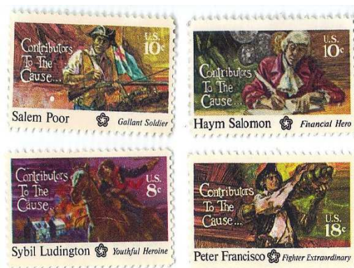
Figure 5: 1975 Contributors to the Cause Bicentennial Stamp Set

On a cool, dark night, sixteen-year Sybil mounted her horse and rode along the roads of her home county in New York with a mission to wake militia men to tell them of news her father had received. Captain Henry Ludington had received word that Danbury, Connecticut, would need reinforcement troops. Sybil had a mission like that of the famed Paul Revere to ride through the night alerting all that would listen that the British were to attack Danbury. Thanks to Captain Ludington and Sybil, the Putnam County Militia came to the aid of Danbury Connecticut. The British forces could push through