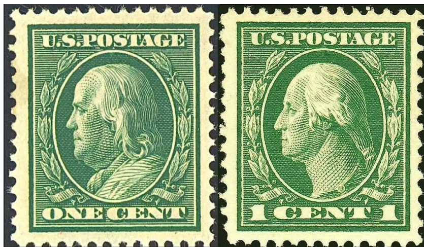
Figure 2: One Cent Franklin and Washington 8

Commemorative postage stamps have always been an excellent way of honoring the memory of someone or something that has made a lasting impact on the history of the United States. In 1957, The Citizen's Stamp Advisory Committee (CSAC) was established to screen