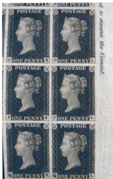
Figure 1: Penny Black 7

By 1855, well after the American Revolutionary War, yet on the eve of the American Civil War, pre-payment of postage became mandatory in the United States. Pre-payment took form in adhesive labels much like the British Royal Mail's Penny Black . The Penny Black was the first adhesive stamp of its kind that boasted a profile image of Queen Victoria. Pictured in Figure 1 to the left, below, is the first postal stamp ever issued in Great Britain and in the world in 1840. The United States followed suit shortly after the adoption of their mandatory pre-paid postage with the five cent Benjamin Franklin and the ten cent George Washington in 1847; pictured below in Figure 2 on the right.