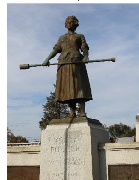
Figure 4: Monument of Molly Pitcher at the Old Graveyard in Carlisle, PA