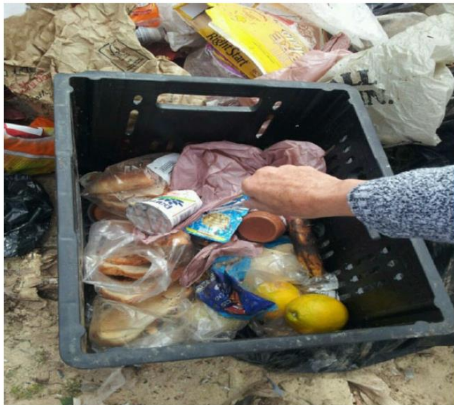
Figure 3. Food recovered from the landfill.