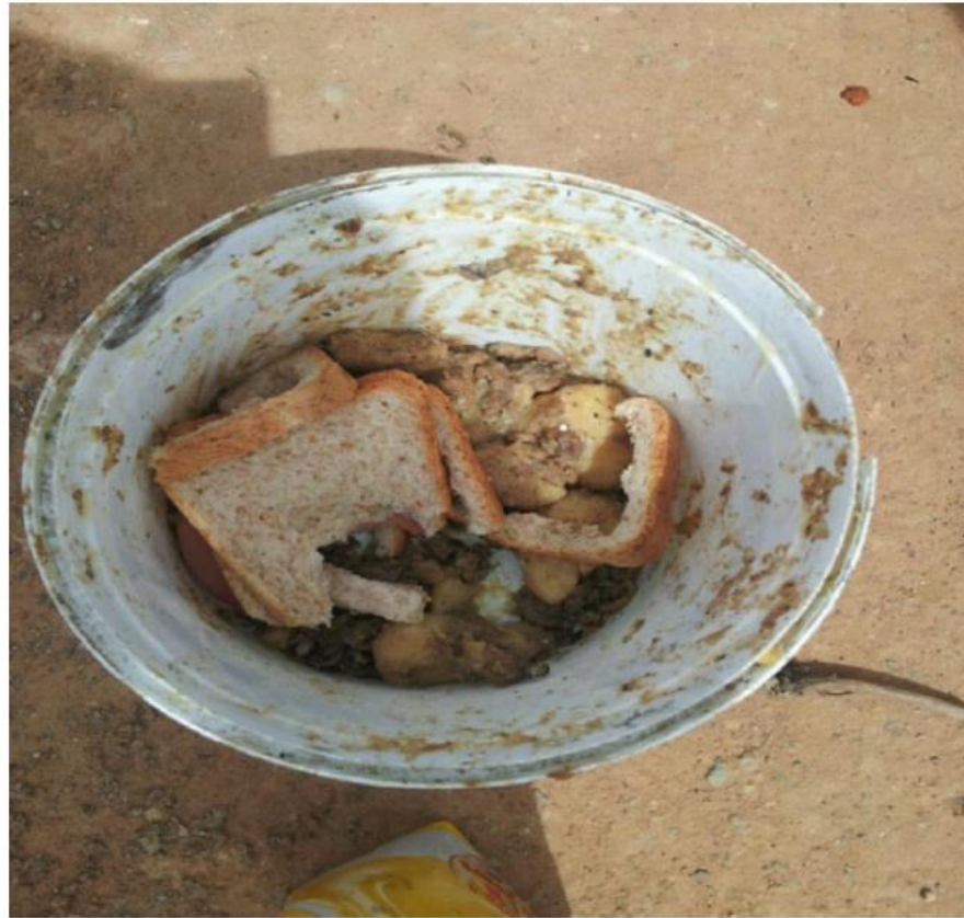
Figure 2. 'Stew' cooked on the landfill where everybody contributes.

Other foodstuffs like bread are consumed as is (Figure 3). An initial review of the 24-hour recall intake instrument revealed that many waste pickers consume only one meal a day, with some reporting that they consumed nothing other than water for a whole day. This was confirmed by the data in Table 6.