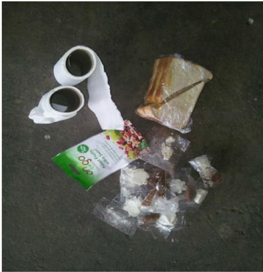
Figure 1. Food picked up from the landfills.