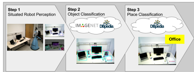
Fig. 1: Overview.

We use a robot platform to observe the environment at various waypoints specified in its environment. The robot is provided with a SLAM map of its environment, and a set of waypoints within this map. At each of these places the robot perceives its surroundings by taking multiple views at different angles (360°). The different views of the robot are aligned and integrated into a consistent environment model in which object candidates are identified and clustered into groups according to their proximity. For each object candidate, we predict its class by using its visual appearance as an input to classifiers trained on a large-scale object database, namely ImageNet. Based on the set of labelled (or classified) object candidates which are in the same group, we perform a web-based text-mining step to classify the region of space constrained by a bounding polygon of the group of objects.