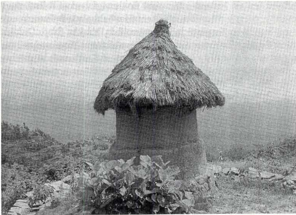
Plate 3 The New Stupa

The new stupa is located two thirds of the way up on the western hillside. The choice of this location seems to be anything but arbitrary: the western hill-side is turned away from the Dharan (Nep. Dharān ) – Dhankuta road and therefore seems