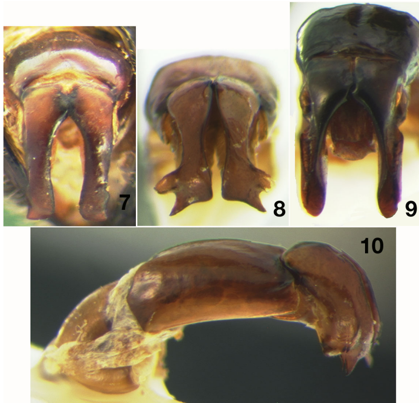
Figure 7-10. Male genitalia of the new species of Paragnorimus . 7) Parameres of Paragnorimus hondurensis . 8) Parameres of Paragnorimus howdeni . 9) Parameres of Paragnorimus atratus . 10) Lateral view of Paragnorimus howdeni .

female paratype at EAPZ labeled a) “HONDURAS: Fco. Morazán / El Zamorano / Mayo – Julio / Estudiante EAP” (typeset), b) “013.827 / EAPZ” (typeset, light blue label). One female paratype at FSCA labeled “HONDURAS: Dept. Francisco / Morazon Cerro Uyuca / 6300ft., 6-VI-1993 / coll. M.C. Thomas” (typeset). One male and one female paratype at BDGC labeled “HONDURAS: F. Morazán / La Tigra Nat. Park / NE Tegucigalpa / 4.VI.1994 2125 m / B.D. Gill” (typeset). All types listed above also bear my red or yellow type label.