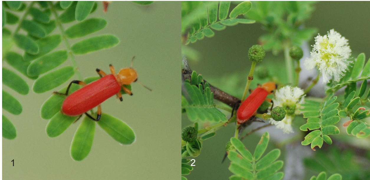
Figure 1-2. Adults of Aphelochroa sanguinalis (Westwood) (Coleoptera: Cleridae) on Acacia tortilis (Forsskal) Hayne (Fabaceae) in Kruger National Park, South Africa. 1) Male on foliage. 2) Female on flowers.

manipulated so that the clerid's mandibles can be applied to the prothoracic-mesothoracic suture. This suture is opened by mandibular pressure and the contents of the prothorax are then consumed. The elytra and metathoracic wings are removed by the clerid's mandibles, and the meso- and meta-thoracic and abdominal contents are consumed by biting through the meso- and meta-thoracic and abdominal tergites. As the clerid finishes feeding on each body section, the hard portions of the exoskeleton are discarded.