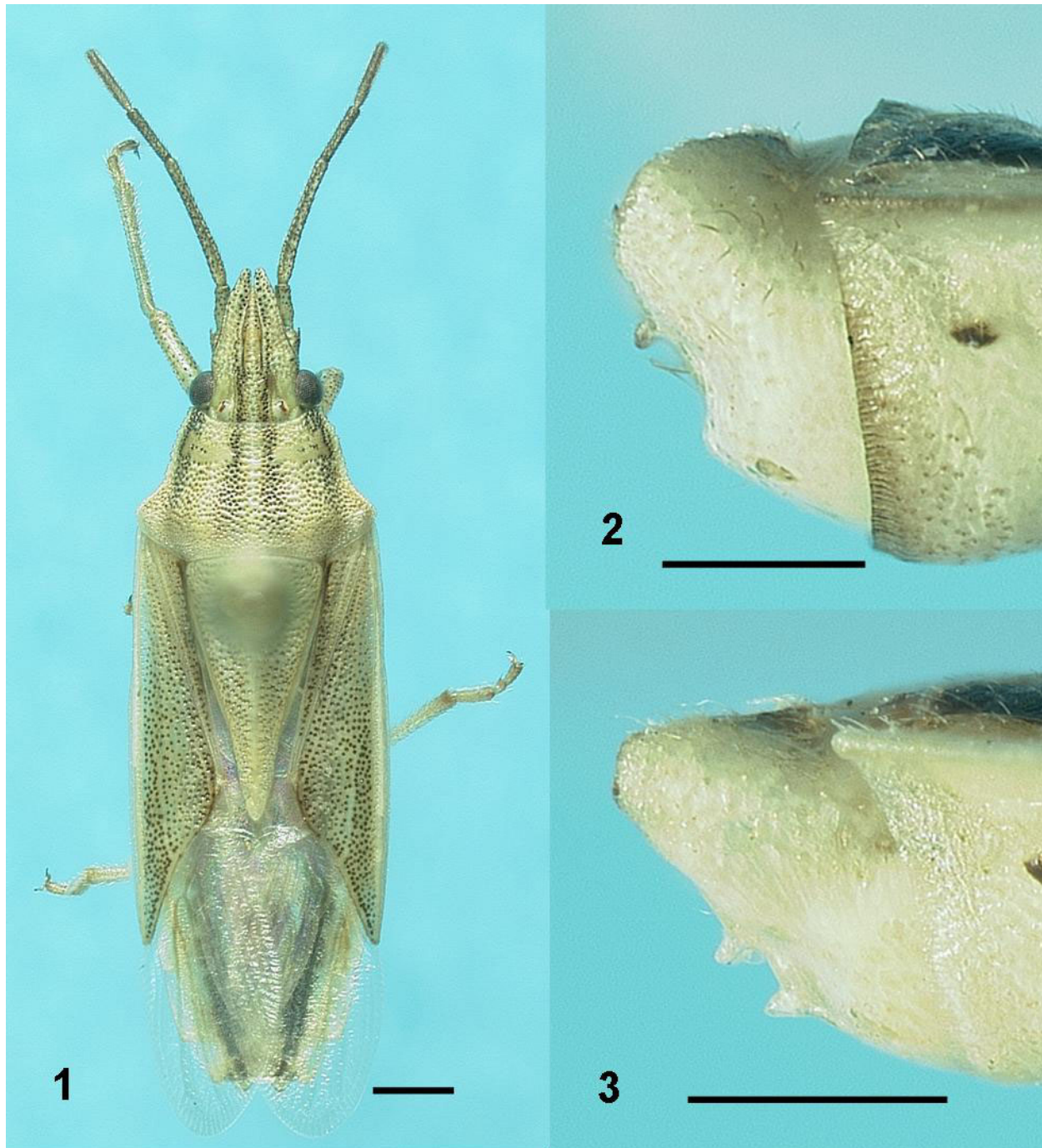
Figure 1-3. Mecidea spp. 1) Habitus, dorsal view, Mecidea longula . Dimensional line equals 1.0 mm. 2-3) Male genital cup, lateral view, t = tubercle. Dimensional lines equal 0.5 mm. 2) Mecidea longula . 3) Mecidea minor .

began operating and monitoring an ultraviolet light trap in the vicinity of Miami International Airport. The author TTD collected a number of specimens of M. longula in south Florida during 2008-2009 in such a trap, suggesting that it is now established in the state. This paper provides a key and illustrations for species of Mecidea found in the United States to facilitate recognition of the introduced species, and reports a new host record for M. longula . In addition, new distribution records from the Caribbean are given.