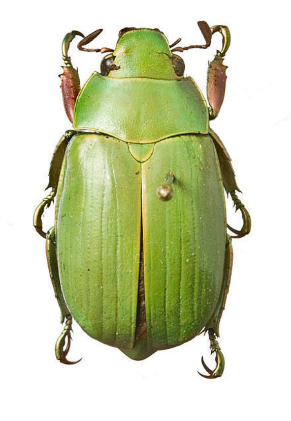
Figure 1. Male Chrysina diversa (Ohaus) collected at the Las Cuevas Research Station, Cayo, Belize, scale in millimeters.

The four specimens collected in June 2006 were all collected at light on the night of the 12th of June. The circumstances relating to their capture are worth recounting here. During the first two and a half weeks of June 2006, James Kitson and I collected beetles every night from a mercury vapor light set up on the side of the main building of the Las Cuevas Research Station. We also collected at the many lights around the various buildings in the vicinity and, during the last week, at a second mercury vapor light set up approximately 500 m away along the road leading to the station. No specimens of C. diversa were collected at any of these lights throughout that time, although the overall scarab beetle diversity was substantial (C. Gillett personal observation). However, during one evening of light rain we were able to take a relatively weak actinic bulb (powered from a portable