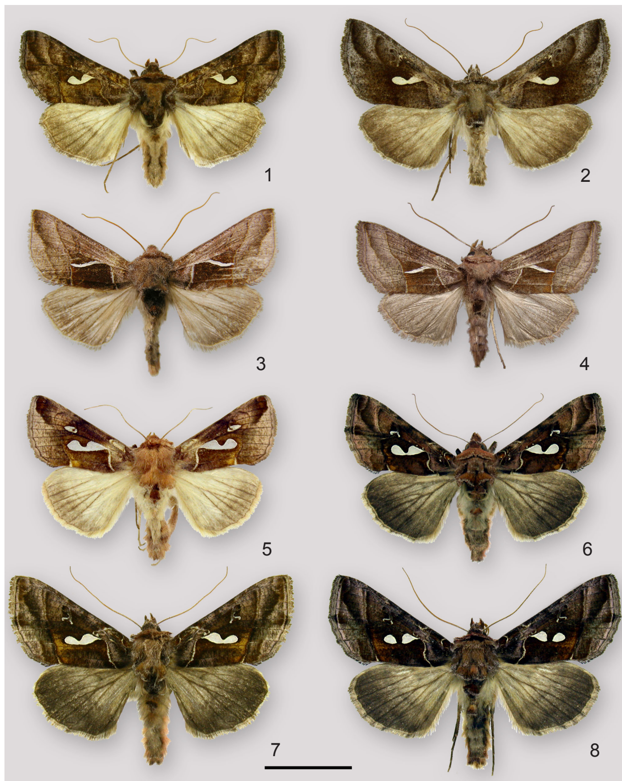
Figure 1–8. Megalographia spp. 1) M. monoxyla , m, Cochabamba, Incachaca, Bolivia. 2) M. agualaniata , m, Cochabamba, Incachaca, Bolivia. 3) M. culminicola , m, Ecuador. 4) M. culminicola , f, Junin to Huanuco Hwy., Pasco, Peru, 3600 m. 5) M. bonaerensis , m, Curitiba, 920 m, Paraná, Brazil. 6) M. biloba , m, San Gerardo de Dota, Cartago, Costa Rica. 7–8) M. talamanca , m, Reserva los Nimburos, 3150 m, Cerro de la Muerte, San José, Costa Rica.