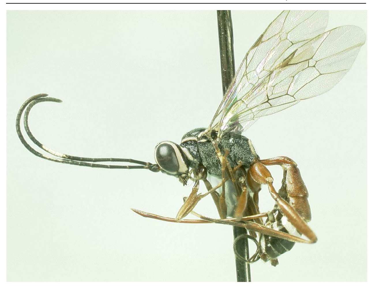
Figure 6. Phycitiplex lepidus, female, holotype. Santa Vera Cruz, La Rioja, Argentina. Lateral view of entire insect.

anterior and humeral margins of pronotum, most of tegula, line on subalarum, anterior 0.5 of scutellum, and a broad band from each crista to apex on apical face of propodeum; gaster with tergite 1 dark red, 2 and 3 duller red with some dusky staining laterad, and tergites 4-8 shining black with a broad and complete apical white band on 4, and similar but dorsally much interrupted white bands on 5-7; fore and mid legs with coxa black and blotched with white, trochanter white with dorsum mostly black, trochantellus black and reddish brown, femur light orange, tibia duller orange and faintly dusky, and tarsus blackish with weak brown staining; hind leg with coxa, trochanters, and femur red to orange red, tibia duller orange with slight dusky staining and black on apical 0.1, and tarsus black with white on third segment and on basal 0.5 of fourth; wings hyaline.