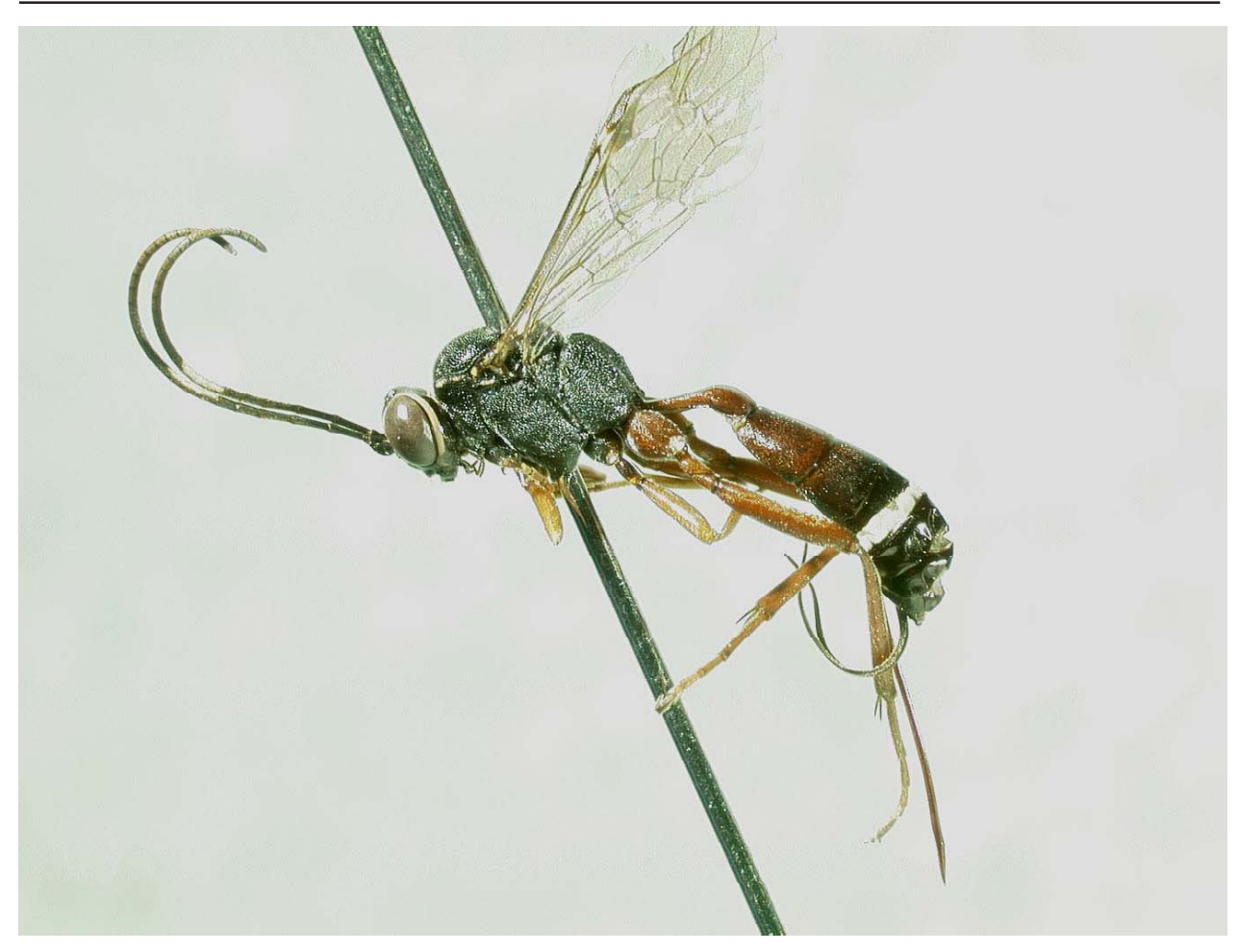
Figure 1. Phycitiplex obscurior, female, paratype. Santa Vera Cruz, La Rioja, Argentina. Lateral view of entire insect.

Specific name. From the Latin comparative adjective obscurior (darker).