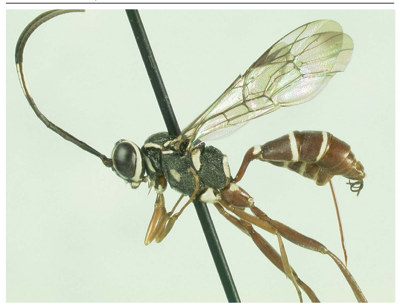
Figure 2. Phycitiplex tricinctus, female, paratype.Santa Vera Cruz, La Rioja, Argentina. Lateral view of entire insect.

than basal and strongly declivous. Malar space 0.66 times as long as basal width of mandible. Wing venation: areolet large with intercubiti very strongly converging above, second abscissa of radius 0.4 times as long as first intercubitus. First gastric tergite: postpetiole short and broad, 2.0 times as wide at apex as long from spiracle to apex, dorsal carinae obsolete, surface smooth and polished with weak microaciculation that fades out apicad and with a few, widely scattered, shallow, medium sized punctures. Second gastric tergite: rather mat with abundant, quite small, shallow but well defined subadjacent to adjacent punctures emitting short, mostly a little overlapping setae. Ovipositor: straight, slender, strongly compressed; 0.32 times as long as forewing; nodus weakly defined by presence of a minute notch, profile of dorsal valve between notch and apex evenly tapering, slightly convex, tip 0.18 times as high at notch as long from notch to apex.