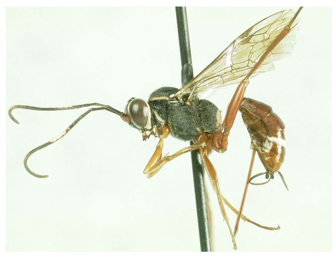
Figure 3. Phycitiplex unicinctus, female, holotype. Santa Vera Cruz, La Rioja, Argentina. Lateral view of entire insect.

Description. Female Holotype . Color: scape light reddish brown, flagellum black with a white band above on segments 5 (at apex) to 9; head and mesosoma with faint reddish staining on mandibles and around clypeus and with white markings as in P. tricinctus except no white on center of face, tegula not wholly white (brownish behind), no white blotch on mesopleural disc, scutellum white only on basal 0.6 with black toward apex, and dorsal metapleuron entirely black; gaster as in P. tricinctus but with a broad white apical band only on tergite 4 and with a little white in and briefly above lower hind corners of