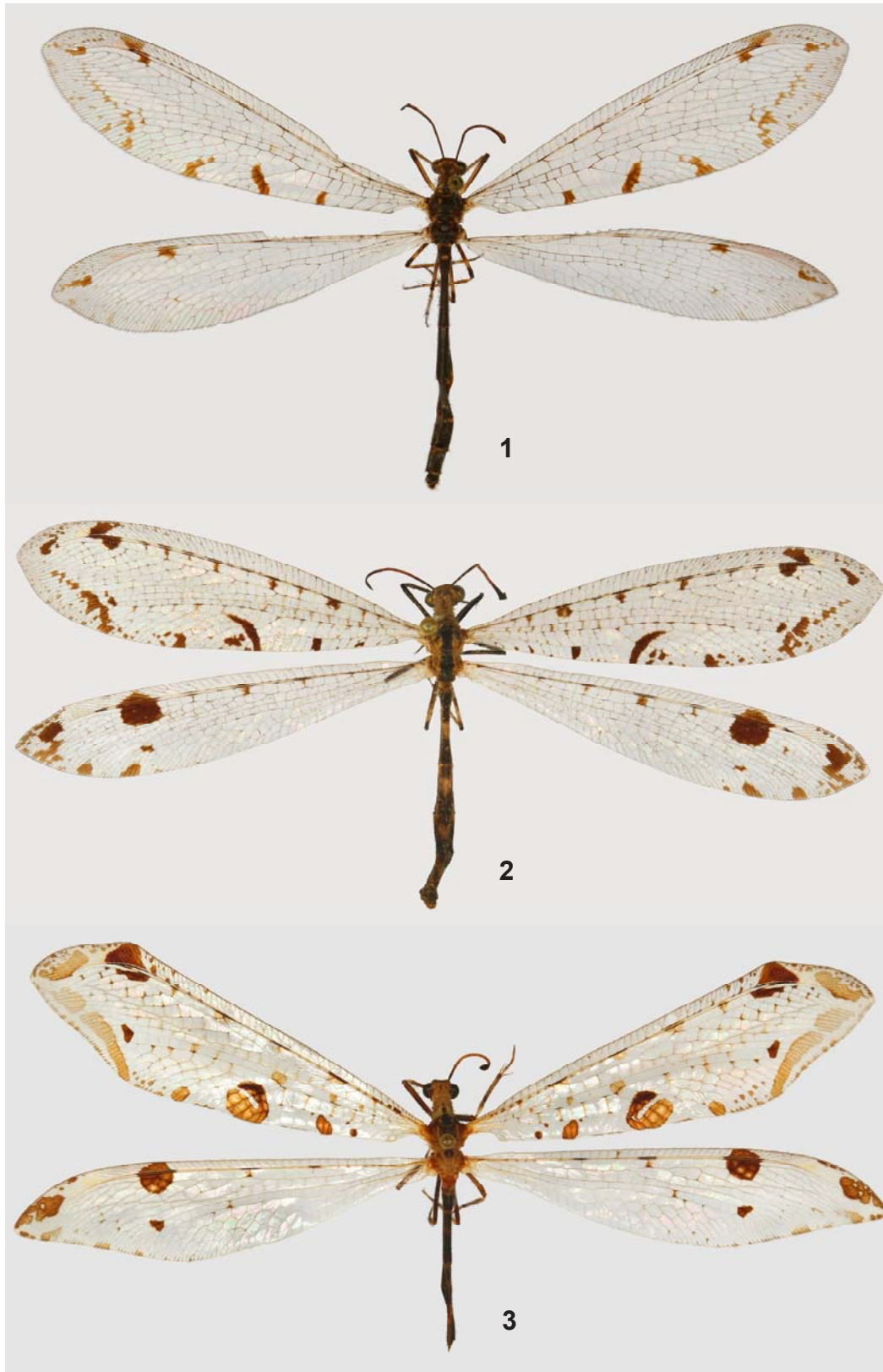
Figure 1-3. Adult Dendroleon females, full dorsal view. 1) D. speciosus . 2) D. obsoletus . 3) D. porteri , holotype.