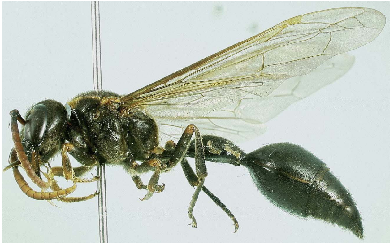
Figure 1. Zethus stangei , male holotype, lateral view of entire insect showing habitus. Note that the stem is very short.