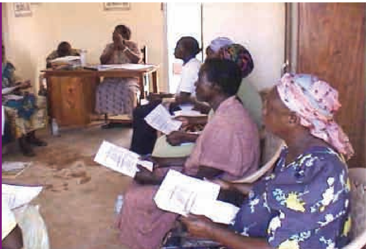
LFCLA Board meeting – planning for 2008

LFCLA invested in understanding what they wanted to achieve, how to avoid raising false