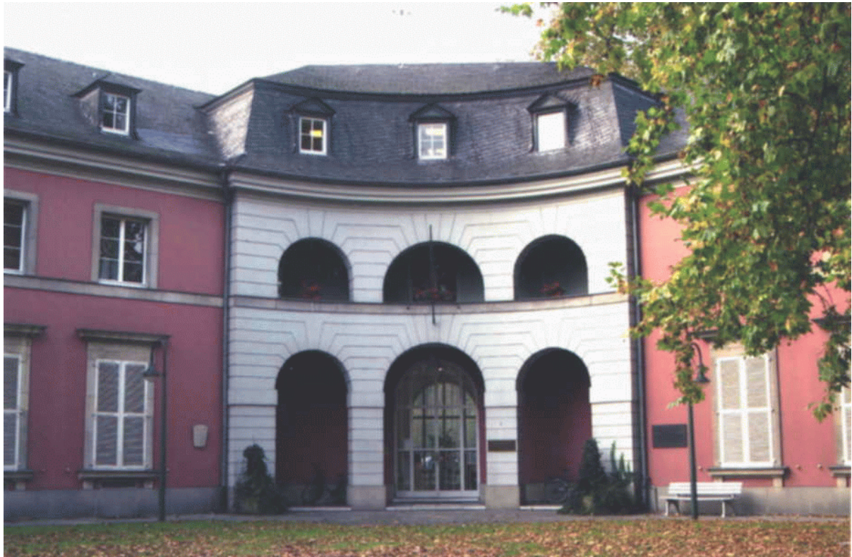
1: The building of the Theatre Museum Düsseldorf