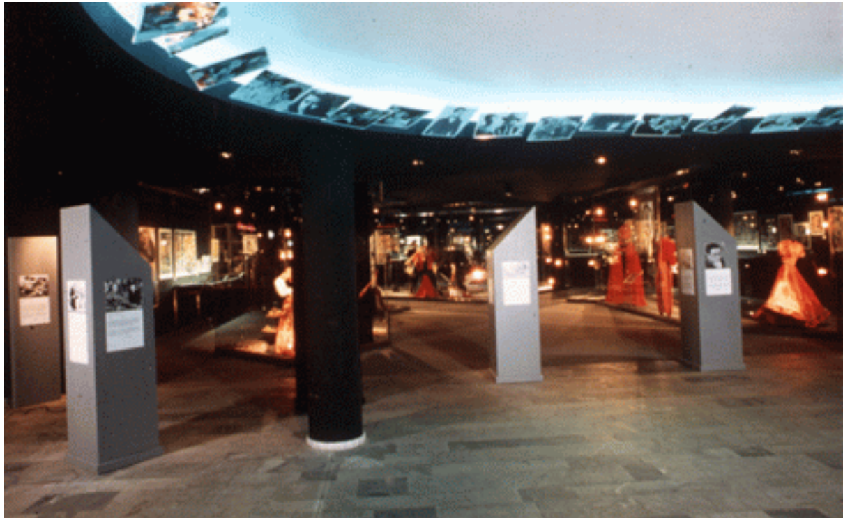
2: The Pantheon of Film - Permanent exhibition of the Film Museum