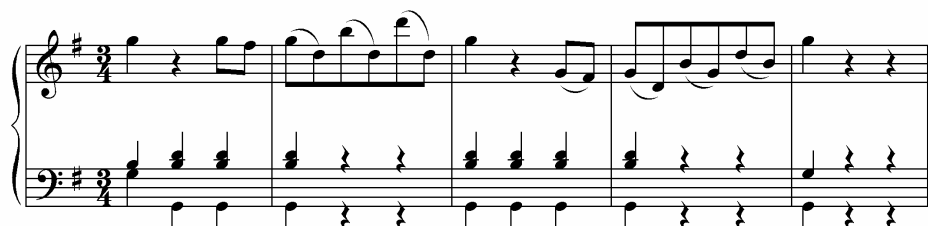
Example 1 Michael Haydn, “Die Hochzeit auf der Alm,” overture, mm. 131-135

To these well-know influences, I wish to add one more—which I discovered in my recent researches. In May 1768, Michael Haydn’s most famous dramatic work, the singspiel “Die Hochzeit auf der Alm” MH 107, had its premiere in Salzburg. Mozart, then aged 12, was staying in Vienna at the time. It appears that he could only have become acquainted with Haydn’s opera at a later time, in January 1769, when he returned to Salzburg. Yet, in that same year, Mozart composed his own German singspiel “Bastien und Bastienne” K 50 (46b), which was probably performed for the first time in Mesmer’s house a few months later, in October 1768. 14 Both works have a similar pastoral setting, and this is Mozart’s only German opera from his Salzburg period. More strikingly, both works open with an overture in G major in 3/4, and have a common musical motif. In fact, the main theme of Mozart’s “Intrada” (which shows a remarkable likeness to the first theme in the first movement of Beethoven’s “Eroica” symphony) is to be found in a varied form in Haydn’s overture as well (mm. 53-57 and 131-135). These similarities are shown in Examples 1 and 2. 15