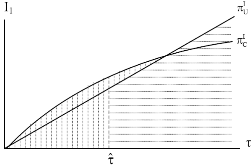
Figure 2: Illustration of Proposition 2.