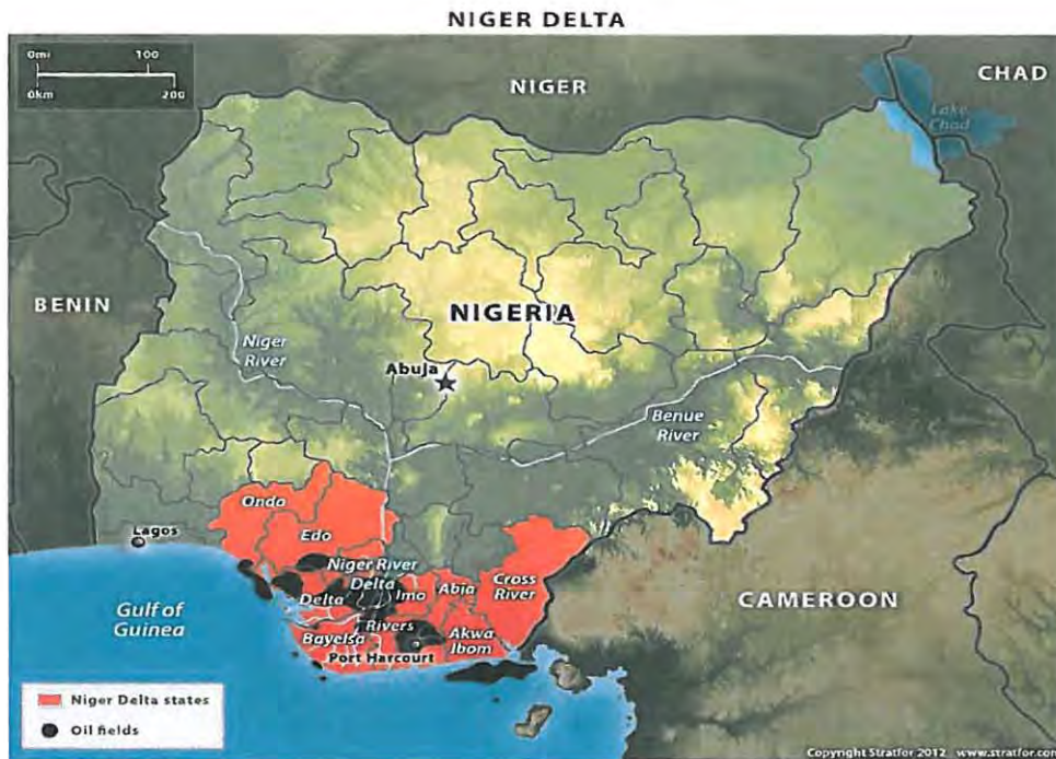
Map 1: Geographical positioning of the Niger Delta region in Nigeria, Source: Stratfor Global Intelligence (2012)

About 1 500 of these communities are host to Nigeria’s oil industry including MNOCs, state and local oil companies, oil service companies, export terminals, refineries and a huge liquefied natural gas sector (Obi and Rustad, 2010:4; Ghazvinian, 2007:18-19). Thousands of miles of oil pipelines interlace the mangrove creeks of the Delta, which provide the Nigerian state with 70 to 80 percent of all its natural resources. In addition to being rich in oil, the Delta wetland is also rich in fish and wildlife resources, with many unique types of plant and animal species (Ghazvinian, 2007:19; Omotola, 2006:3).