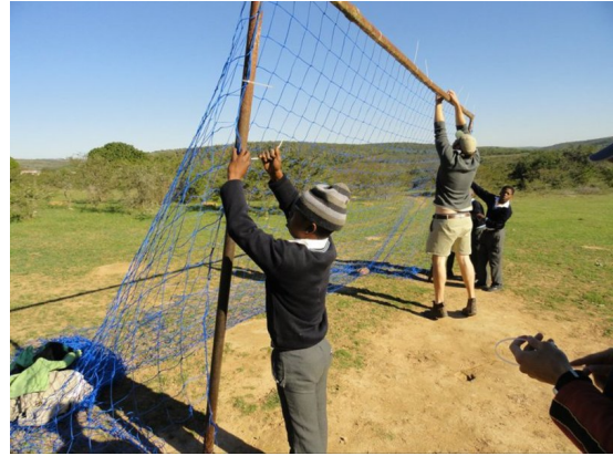
Photograph 6 and 7: Kariega Foundation volunteers making a difference at Farmerfield School.

With the assistance of the Kariega Conservation Volunteer Programme and its volunteers, the Foundation has achieved to complete many projects at these schools and in the community in general, however there is still lots to do.