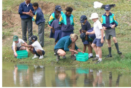
Photograph 10 and 11: Environmental education at Amakhala Game Reserve.