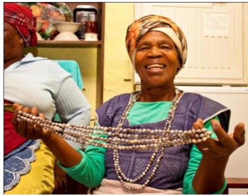
Photograph 3 and 4: Hand made dolls and beaded articles made by women of the Ubunye Foundation, Kwandwe Private Game Reserve.

A Craft Centre on Amakhala Game Reserve mentioned that unemployed members of the local community are offered an opportunity to generate income via their Craft Centre, where beaded objects, sewed and printed items are sold. Beaded bracelets made by the teenagers of the Isipho Project are also sold at the Centre. A percentage of the profit of these bracelets goes to a bursary fund to support these teenagers with some tertiary education. 94