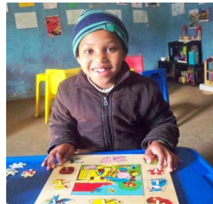
Photograph 8 and 9: Safe parks and local school education at Kwandwe Private Game Reserve.