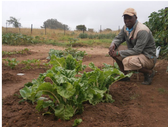
Photograph 5: The vegetable growing project at Amakhala Game Reserve.

reserve. Fifteen prospective gardeners, including three from the reserve were subsidised a training programme on permaculture. According to the reserve's Foundation Coordinator, the establishing of the vegetable gardens has been a slow process and there has been a high turn-over of staff, particularly in the Isipho (Aids Orphanage) garden. Nevertheless, during the last few months of 2013, the garden at Isipho provided their nutrition programme with nearly R900 worth of vegetables and sold a further R500 worth of vegetables into the local community. 95