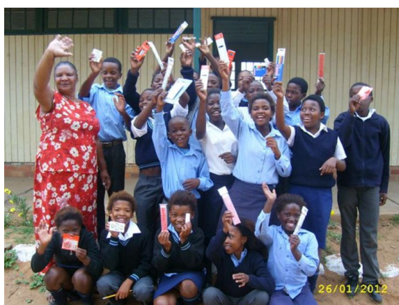
Photograph 12: Volunteer donations for Farmerfield School.

The Kariega Foundation and Conservation Volunteers support numerous maintenance and improvement projects at Farmerfield School. These projects include; fixing the old school ground fence to stop roaming livestock from destroying the school vegetable garden, replacing broken classroom windows and, revamping and painting of classrooms to name a few.