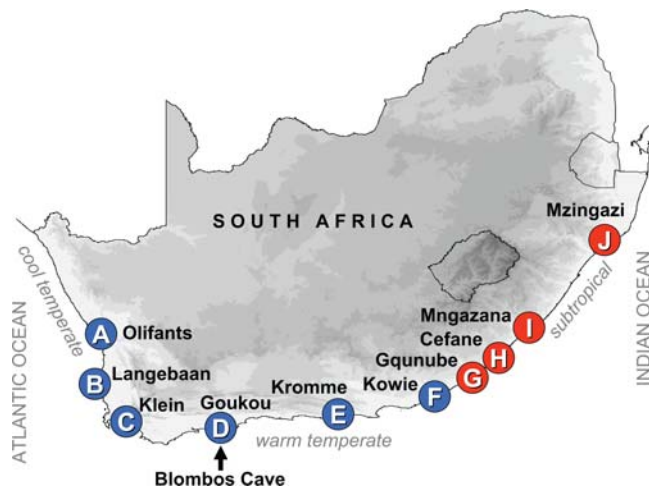
Figure 1. Sampling localities. Sampling localities (A–J) from which specimens of Nassarius kraussianus were collected. The sample sizes were: A=350, B=104, C=132, D=112, E=47, F=183, G=83, H=54, I=71, J=94. Blue circles indicate localities dominated by haplotypes present in the western range of the species' distribution, and red circles indicate sites where haplotypes of the eastern lineage were mostly found. The location of Blombos Cave (where N. kraussianus fossils were found that were worn as beads by human beings during the Middle and Late Stone Age) is indicated. doi:10.1371/journal.pone.0000614.g001

provinces, but each province has its own combination of species [8–10]. Genetic data show that some coastal invertebrates with planktonic larvae or direct development that occur in more than one province comprise two or more genetically distinct regional lineages, with boundaries that coincide with those between the biogeographic provinces [11–17]. Given the wide distribution range of N. kraussianus and the fact that it disperses by means of planktonic larvae [18], it is possible that this species may comprise several regional phylogeographic units that differ in shell size, e.g. a large-bodied lineage adapted to cooler water temperature and a small-bodied lineage present in warmer water. Their distributions may have shifted as a result of climate change, with the small-bodied lineage having replaced the large-bodied lineage on the south coast. Alternatively, the larger lineage may have become extinct (e.g. during the last glacial maximum ~15–25 000 years ago) and been replaced by the smaller lineage throughout its range (e.g. at the beginning of the present interglacial, <10 000 years ago). The two lineage-hypothesis is rejected if a) no genetically distinct lineages of N. kraussianus are found that differ in shell size and b) expansion events from south-eastern to south-western Africa evident in the genetic data do not significantly postdate the MSA.