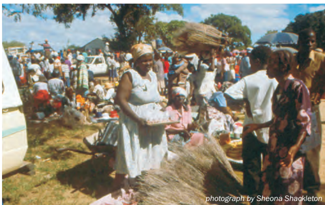
Build on existing initiatives

Considerable local initiative and energy exists with regard to the harvesting and sale of natural resource products. Support needs to be directed at promoting this already vibrant sector. Too often rural development initiatives focus on cooperative type projects, often with new entrants, that tend to be exclusive, and that involve new products that are often high-risk. Local markets are viable. Intervention should focus on improving conditions and removing obstacles to the current trade. Already thriving trades should not be over-manipulated, and dependency should not replace previous self-sufficiency. The Mineworkers Development Agency's (MDA) new, inclusive 'service centre' approach to supporting individuals and self-initiative as well as recognising small enterprises and part-time livelihood activities may provide a good model (Philip 2002).