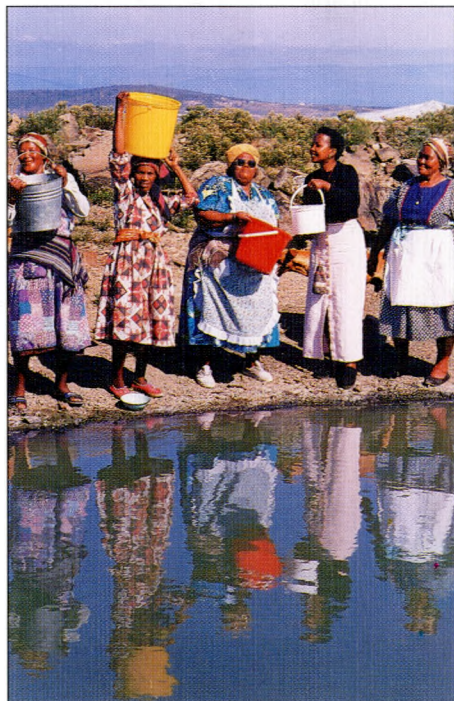
"Rural women in Peddie with ISER researcher"

The Institute publishes an Annual Report (available on request) which sets out its activities and achievements. It also publishes a regular series of Development Studies Working Papers for distribution and sale to interested individuals and institutions. Occasional Papers are published from time to time and are available at reasonable prices. These publications reflect much of the research carried out by the Institute.