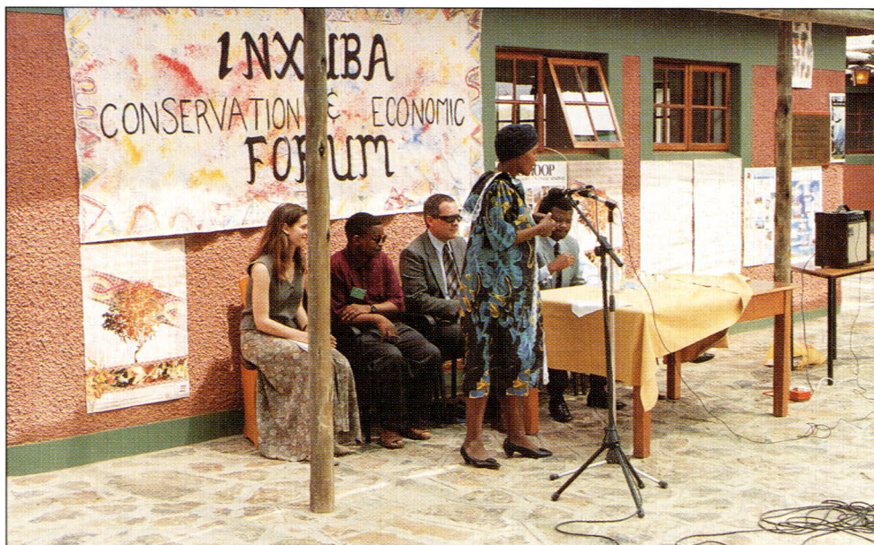
"Launch of the Inxuba (Fish River) Conservation and Economic Forum in October 1995"

The International Library of African Music publishes the Sound of Africa and the Music of Africa record series, as well as the international journal African Music . •