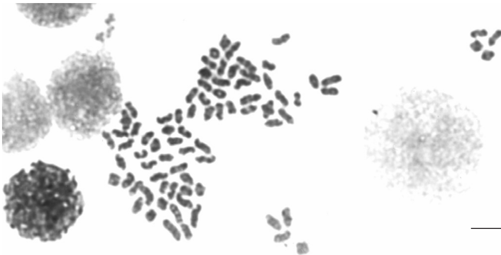
Fig. 2. Photograph of a meiotic spread of a male of Labeobarbus marequensis (Marico River; SAIAB 52700). Scale bar = 5 \mu m.

Since Capoeta is nested within Luciobarbus (Tsigenopoulos et al. 2003) and the latter is phylogenetically distinct from Labeobarbus (Machordom & Doadrio 2001; Tsigenopoulos et al. 2002, 2003),