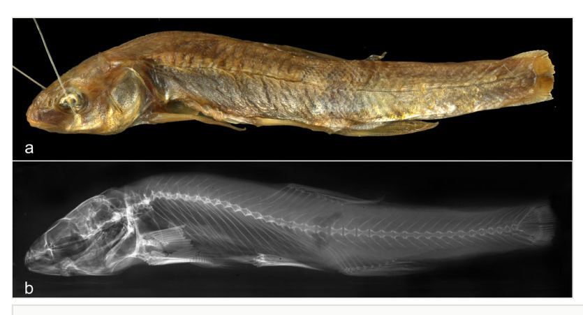
Figure 1. doi Photo (a) and x-ray (b) of the lectotype Phoxinus marsilii (NMW 51225).

The Senckenberg Museum in Frankfurt am Main, Germany (SMF) holds two specimens as syntypes of P. marsilii (SMF 1980), received in 1844 from the NMW. From the NMW acquisition sheet for that year it is evident that two specimens labelled Phoxinus marsilii Heck. were sent to Prof. Joh. Müller but had been sampled in northern Italy, in brooks at Treviso (Acquisition Nr. 1844.III.3), not in the surroundings of Vienna. As such, they are not syntypes of P. marsilii .