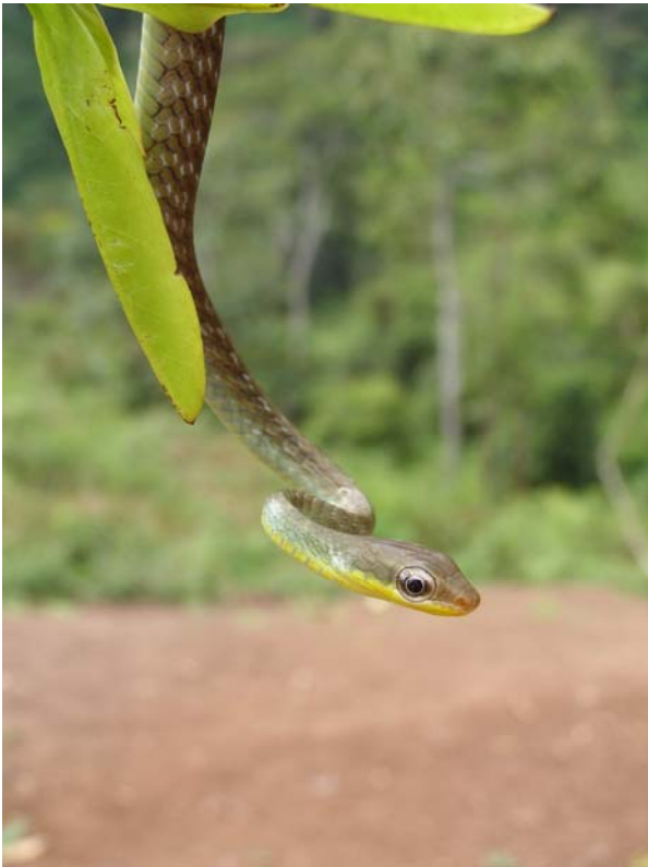
Figure 2. Juvenile male of Chironius exoletus (MHNLS 17931).

Our specimen is a juvenile male (hemipenes partially everted) snout-vent length 293 mm; tail length 185 mm; nasals divided; internasals, prefrontals, and parietals paired; frontal single; loreal present; preoculars 1/1, postoculars 2/2, temporals 1+2, supralabials 9(5+6), infralabials 11(6+7), two pairs of chin shields; infralabials one through six in contact with anterior chin shields, six and seven in contact with posterior chin shields; 12-12-8 scale row formula, dorsal scales with apical pits and only paravertebral rows keeled; ventral scales 150, subcaudals 160 divided, anal plate divided, and 28 maxillary teeth. These characters allow us to identify this specimen as C. exoletus , and to discriminate this from C. carinatus (a sympatric species and very common in the Sierra de Perijá), and the all others species of the genus.