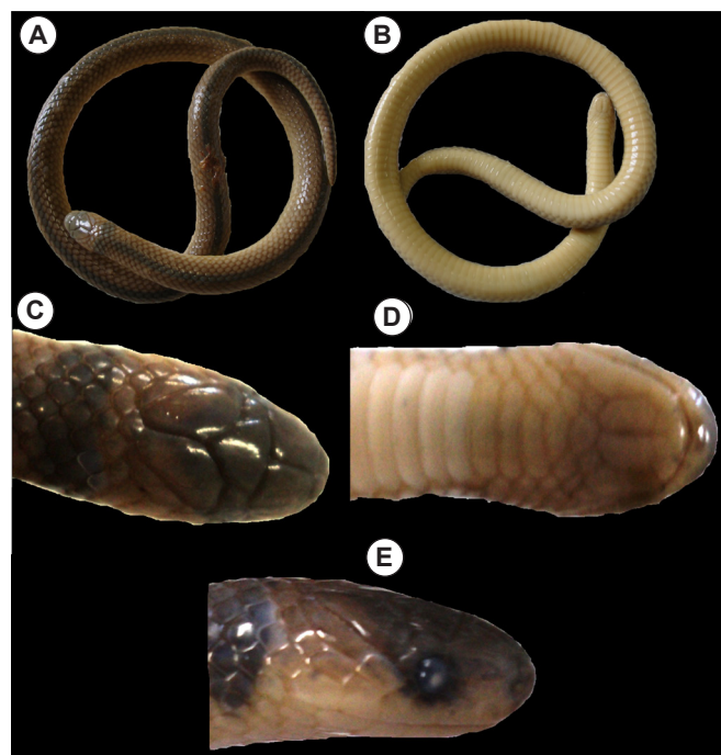
FIGURE 1. Head views of the specimen (CHR 023) of A. paraguayensis , collected in Capão do Leão, Rio Grande do Sul, Brazil.

The specimen CHR 023 (Figure 1) is male, and has 15/15/15 dorsal scale rows, two postocular scales, moderately sized loreal scale, 1+2 temporal scales, seven infralabial scales, seven infralabial scales, three gular scale rows, 146 ventral scales and 32 subcaudal scales, head length of 16mm, snout-vent length of 318mm and tail length of 46mm. Dorsum olive, with a single bluish vertebral line and venter is immaculate cream. This is the southernmost record of A. paraguayensis in the state of Rio Grande do Sul, and, therefore, Brazil, extending the species