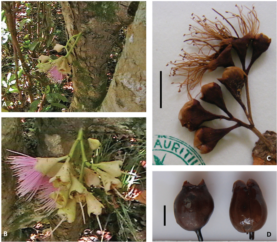
Figure 2. Floral and fruit characters. A and B Sole recorded images of flowering event C Close-up of dried inflorescence D Close-up of two fruits. ( A–C D’Argent & Pynee MAU 25014; D D’Argent & K. Pynee MAU 26448). Scale bar = 1 cm.

Etymology. Syzygium pyneei is named after Kersley Pynee who co-collected the type specimen and is a prominent local botanist.