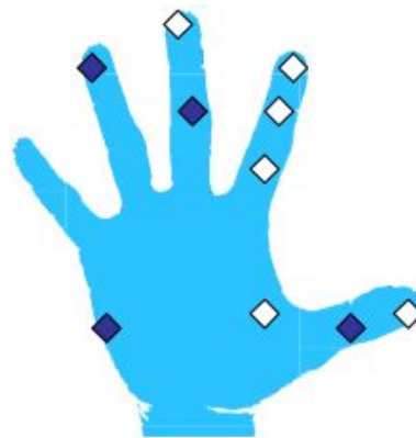
Figure 1. The coarticulation measurement points in the whole study (dark and light diamonds) and in this data (light diamonds). These points are measured in each hand.

In this preliminary study we have measured 6 of those 10 measurement points from each hand. Other 4 measurement points were used to specify the orientation of the hand when it was possible.