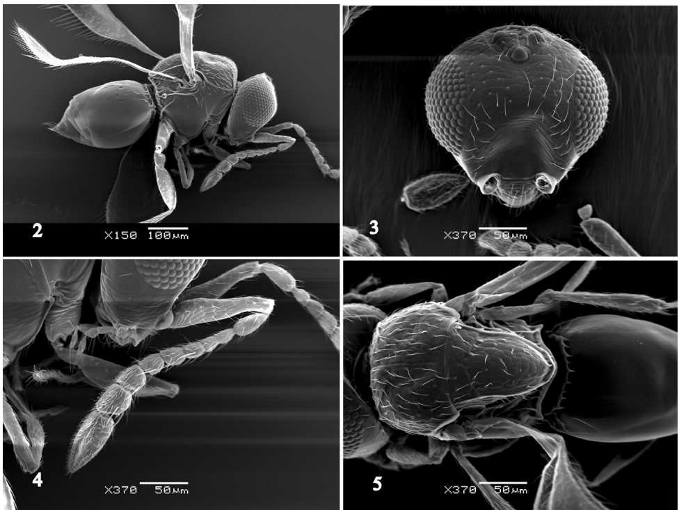
Figures 2–5. Aphanogmus flavigastris . 2 female body, lateral view 3 female head, frontal view; 4 female antenna, lateral view 5 female mesosoma and metasoma, dorsal view. Scale bars: 2 : 100 \mu m; 3–5 : 50 \mu m.