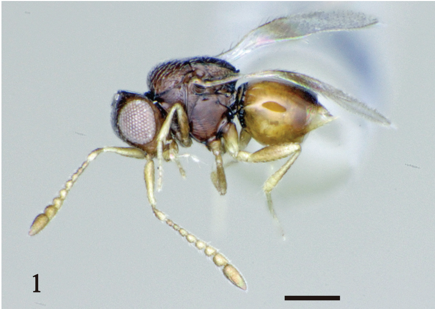
Figure 1. A female of Aphanogmus flavigastris . Scale bar: 100 \mu m.