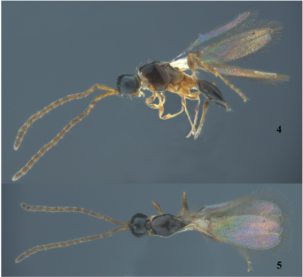
Figures 4–5. Monelata truncata sp. n., ♂, paratype, habitus. 4 Lateral view 5 dorsal view.

remarkably clavate. Eye oval, 1.5 times as long as wide, 1.5 times as long as malar space. Posterior orbit of eye not sinuate. POL : OOL : OL = 1.5 : 4.0 : 1.5.