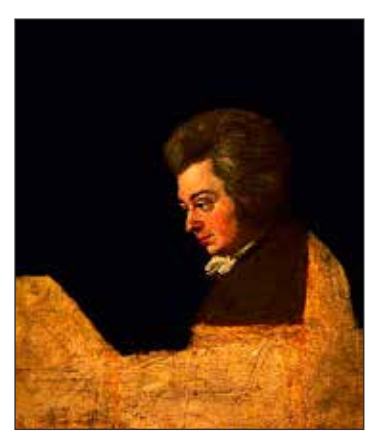
Figure 1. Joseph Lange, Mozart at the piano. Vienna 1789. Salzburg, Mozart Museum

Slika 1. Joseph Lange. Mozart za glasovirom. Beč, 1879. Mozartov muzej u Salzburgu