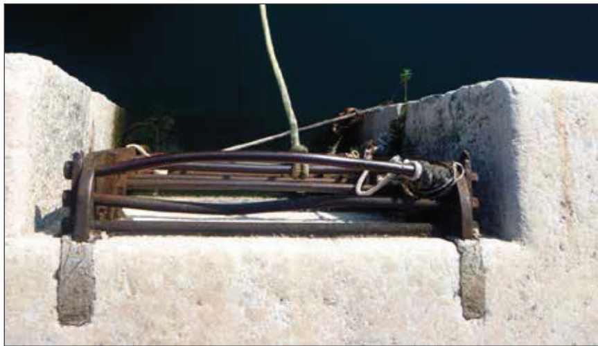
Figure 2 - Possible location of the mareograph/tide gauge at Fiumara

In the first book about climate in Fiume/Abbazia (Rijeka/Opatija), Salcher (1884) gathered and analysed 15 year data (1869-1884) from Fiume