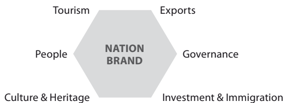
▲ Figure 2. The Nation Brand Hexagoon (Anholt, 2002)

Also in Anholt's (2002) Nation Brand Hexagon (Figure 2.), except for tourism, exports, governance, investment and immigration, culture and heritage people are also mentioned as an important factor contributing to the perception of a country and its "place branding". People, as one of the factors allowing to reconstruct the global perceptions of a nation's image and its appreciation of its contemporary culture, should be measured for their reputation, competence, education, openness and friendliness as well as levels of hostility and discrimination.