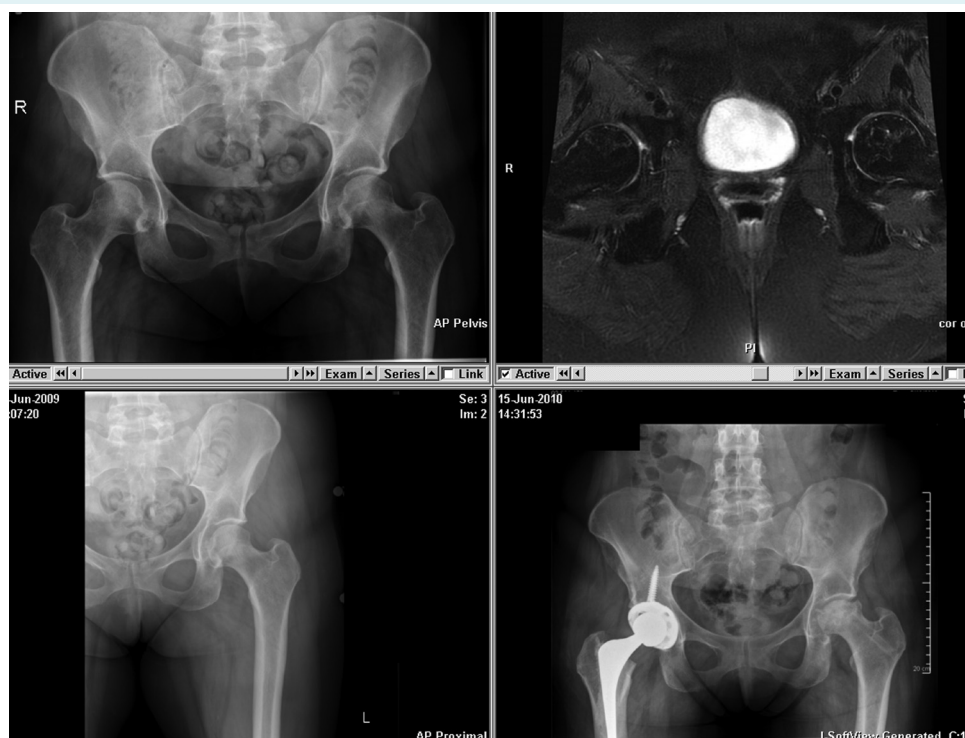
FIGURE 4. A 43-year-old female on steroids for cancer treatment presents with bilateral hip involvement. Upper left: anteroposterior (AP) pelvis radiograph taken on presentation. Lower left: AP of the left femur taken on presentation. Upper right: T2 coronal oblique MRI showing significant bilateral head involvement prior to treatment. Lower right: AP pelvis shows complete collapse of the left femoral head resulting in total hip arthroplasty 1 year post-operative.

The original work by Hernigou was a retrospective study that popularized the addition of bone marrow concentrate to a core decompression (22). The information obtained from the study have been proven very beneficial in identifying the procedure and etiologic data, however the study did not compare the results with core decompression in a prospective manner. Since this study, at least 4 studies have prospectively compared the results of standard core decompression and core decompression with autologous bone marrow introduction.