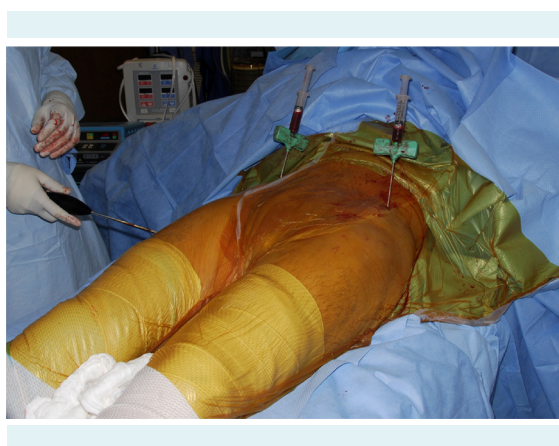
FIGURE 1. Patient with iliac crest aspirators in place, with bilateral hips prepared for decompression and injection of concentrated bone marrow (published with permission from Sierra RJ). Alternative procedure for osteonecrosis of the femoral head, Figure 2 (24).

The patient is placed supine on a radiolucent table and general anesthesia is performed. Fluoroscopic imaging is used at this time to ensure that adequate anterior-posterior (AP) and frog-leg lateral images can be obtained with the patient's position. The operative hip/hips and both iliac crests are prepped and draped into the surgical field in a sterile manner (Figure 1). Two grams of cefazolin should be given at this time. The procedure begins by obtaining iliac bone marrow aspirate. A 2-3-mm incision is made over that anterior aspect of each anterior iliac crest. When the iliac crest is visible, the trochar (Marrowstim, Biomet Biologics, Warsaw, IN, USA) can be inserted into the iliac crest in between the two tables of ilium and bone marrow can be aspirated into 10 mL-syringes. We use the Bio-Cue System (Biomet Biologics) to concentrate the bone marrow aspirate obtained. Each vial requires 57 mL of bone marrow aspirate mixed with 3 mL of heparin to prevent clot formation. A single vial produces 6 mL of concentrated bone marrow aspirate, and we typically utilize two vials per hip. Once collected, the vials are placed in a centrifuge for 15 minutes to adequately concentrate the mononuclear fraction of blood that contains the mesenchymal progenitor cells. Additionally, 120 mL of anticoagulated blood are placed into two