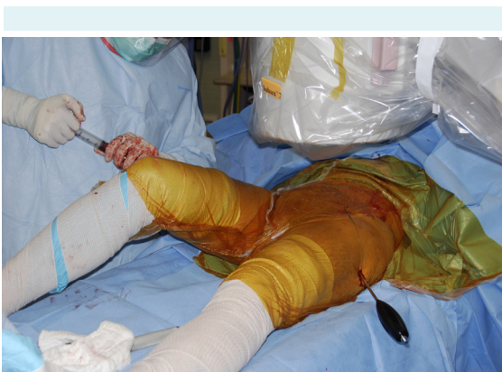
FIGURE 3. Injection of bone marrow concentrate into the area of necrosis (published with permission from Sierra RJ). Alternative procedure for osteonecrosis of the femoral head, Figure 4 (24).

At this time, the contents of the bone marrow concentrate and the platelet-rich plasma have completed the centrifugation process. Approximately 12 mL of each should be obtained. They are combined in a 30 mL-syringe in a sterile manner. This can be doubled if both hips are to be injected. The contents of the 30 mL-syringe are then injected into the trochar, which should be positioned in the necrotic lesion of the femoral head. Due to the sclerotic nature of the lesions, it may require significant pressure to inject the contents from the syringe (Figure 3). If excessive resistance is met, the trochar can be retracted while confirming that the tip remains in the area of necrosis. This will increase the space available to inject while ensuring that the mesenchymal stems cells are delivered to the cor-