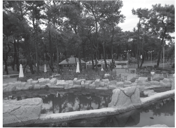
FIGURE 3 Artificial facilities in Kepez/Antalya Urban Forest

The size of urban forests studied varies from 8 to 1 025 ha, whereas the average is 144 ha. 34 out of 52 urban forests have smaller size than the mean value (Table 3). The large difference among the sizes of urban forests is due to the absence of standard sizes. In the Technical Prospectus for urban forests and resting areas, it is stated that the maximum area of urban forest should be 300 ha. In this case, only four out of 52 urban forests studied are larger than that value. In contrast, that prospectus does not mention the minimum limit for the size of urban forests. According to Gezer and Gül [12], the minimum size of urban forests