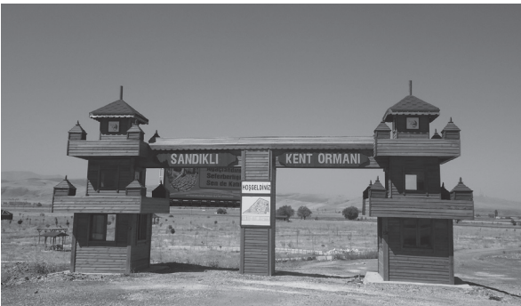
FIGURE 4 An urban forest in plantation area (Sandıklı/Afyon Urban Forest)

The origin of urban forests consists of 51.9% of afforestation (plantation) area, 36.5% of natural forest and 9.6% of picnic area (Figure 4). Most visitors appreciate the naturalness of an urban forest, and the importance of ecological management has increased during the past decade [31].