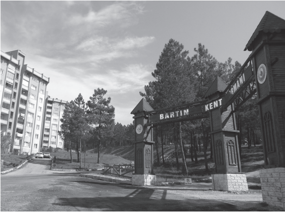
FIGURE 2 A view from Bartın Urban Forest

In Turkey, 28 (54%) of the considered urban forests are within walking distance (Figure 2). They can be reached either by municipal buses (for 19 urban forests) and/or by small buses (for 21 urban forests). However, 11 urban forests cannot be reached either by walking or public transport. These urban forests can only be reached by private vehicles of the visitors. Furthermore, Uslu ve Ayaşlıgil [29] stressed the importance that urban forests should be reachable by either private or public transport.