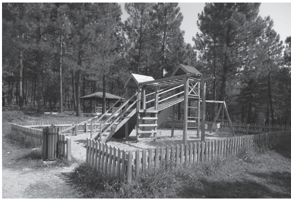
FIGURE 5 A Playground in Bartın Urban Forest

In almost half of the urban forests, there are no car parking area lots and information centers. There are banks in 47 urban forests, viewpoints in 42, fountains in 40, and toilets in 37 (Table 6, Figure 5). Walking paths are the highest among the facilities presented in urban forests. There are walking paths in 49, sport areas in 34 and playgrounds in 45 urban forests (Table 6). In addition, there are no bicycle paths in the majority of the urban forests (94.2%). Çetiner et al. [32] pointed out that parking area lots are important for urban forests to attract visitors.