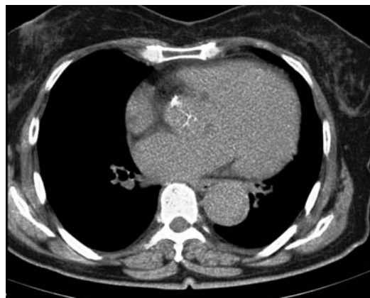
Fig. 3. Helical computed tomography of the aortic valve, not cardiac gated, showing typical X-, instead of Y-shaped closure of the aortic valve.

during the invasive evaluation. Left ventriculography did not confirm mitral regurgitation. The patient was then scheduled for surgical correction. Prior to the surgery, transesophageal echocardiography had been performed. There was a trace of mitral regurgitation even at the state of the volume overload and blood pressure of 170/110 mmHg. Therefore, we decided to perform aortic valve replacement. QAV was noticed at that time for the first time, although thorough diagnostic procedures were done (Figure 2). Retrospectively, we evaluated anatomy of the aortic valve obtained by the helical computed tomography chest scan (Figure 3). According to her life expectancy, we have implanted bioprosthetic valve (diameter of 21 mm). The patient made an uneventful postoperative recovery.