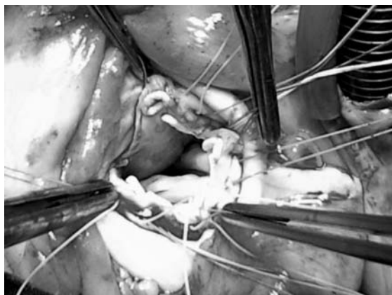
Fig. 2. The aortic valve is excised. Four forceps holding four sutures reinforced by felt pladgets on the aortic valve commissures.