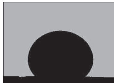
Figure 2 A Cu-40 Ag alloy drop placed on aluminium oxide surface at 1 423 K

The contact angle measurements were conducted at 1 373 – 1 573 K using the sessile drop method. For the experiments, oxygen-free copper and copper-silver alloys with the maximum Ag content of 50 % mass were applied. A high-temperature microscope coupled with a camera and a computer equipped with a program for recording and analysing images was utilized, which enables measurements of relevant liquid metal drop geometrical parameters that are necessary for determination of contact angles. As protective atmosphere during the measurements, argon 6.0 was used. A detailed description of the research apparatus is presented in the article by Siwiec and others [9]. A sample Cu-Ag drop