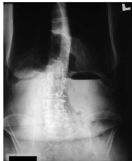
Fig. 1. Initial recorded plain abdominal X-ray picture standing.

Clinical examination determines that the patient had stable vital parameter. Auscultation of lung found diffusely impaired respiratory sounds, in epigastric there