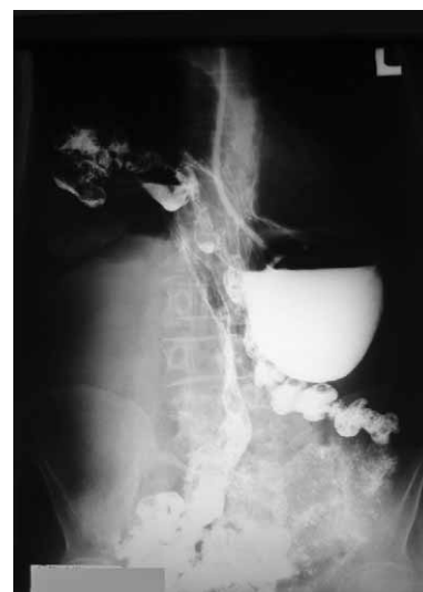
Fig. 4. Recording 6.5 hours after intake of contrast media.