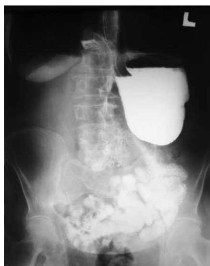
Fig. 3. The recording performed 1 hour after contrast intake.