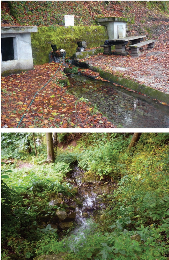
Fig. 1. a) Heavily modified spring of the Dobra River; b) creanal section of the Dobra River where Drusus chrysotus was collected.

Ninety five species of Drusinae (Trichoptera: Limnephilidae) with different distribution ranges are known to inhabit the springs and headwaters of mountain streams throughout European mountain ranges (GRAF et al. , 2008a; KUČINIĆ et al. , 2011a; OLÁH 2010; PAULS et al. , 2008; unpublished data). In Croatia, 4 Drusinae species have previously been recorded (GRAF et al. , 2008a; HABDIJA, 1979; KUČINIĆ et al. , 2010; MARINKOVIĆ-GOSPODNETIĆ, 1979; PREVIŠIĆ, 2009; PREVIŠIĆ & POPIJAČ, 2010; GRAF W., KUČINIĆ M. & PREVIŠIĆ A. unpublished data). Among these, two are widely distributed over European mountain ranges; Drusus discolor (Rambur, 1842) and Ecclisopteryx dalecarlica Kolenati, 1848 (GRAF et al. , 2008a; PAULS et al. , 2006; VUČKOVIĆ et al. , 2011; WARINGER et al. , 2009), and one is a range-restricted endemic: Drusus croaticus Marinković-Gospodnetić, 1971 (distributed in Croatia and SE Slovenia; KUČINIĆ et al. , 2008; PREVIŠIĆ et al. , 2009, URBANIČ, 2004). The fourth Drusinae species in Croatia is most probably the range-restricted endemic Drusus vespertinus Marinković-Gospodnetić, 1976 (distributed in Bosnia and Herzegovina; KUČINIĆ et al. , 2011b). However, only larvae were recorded in Croatia so far, thus this finding needs to be confirmed by the collection of adults (ĆUK R., KUČINIĆ M. & PREVIŠIĆ A., unpublished data).