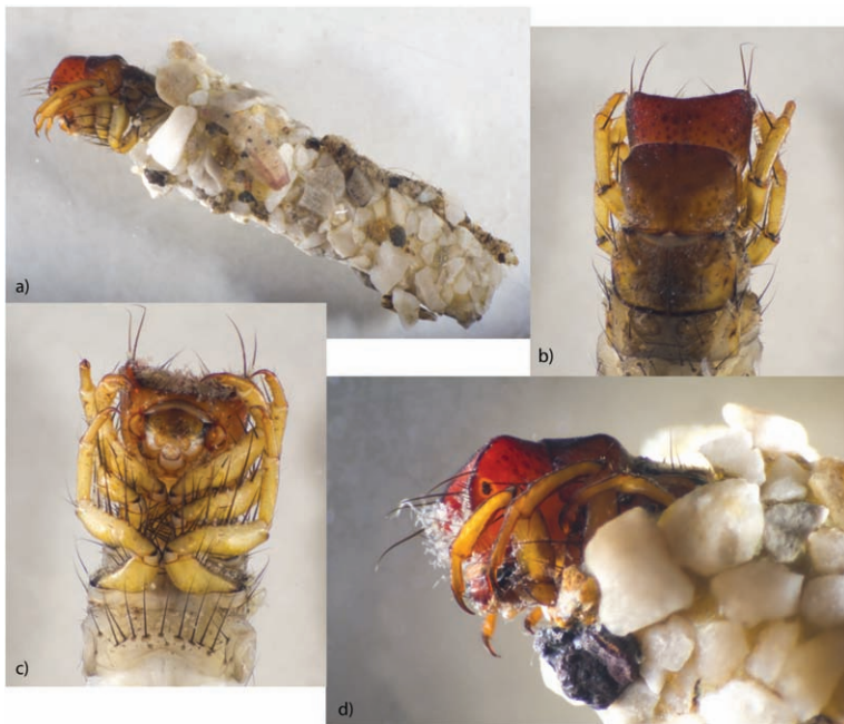
Fig. 3. Drusus chrysotus larva: a) larva in its case, left lateral view; b) head and thorax, dorsal view, c) head, thorax and first abdominal sternum, ventral view; d) head and thorax, left lateral view.

Drusus chrysotus (Rambur, 1842) is distributed in central European mountain ranges (BOTOSANEANU & MALICKY, 1978; GRAF et al. , 2008a) including the Alpine region of neighbouring Slovenia (URBANIČ, 2004); thus this record in western Croatia, Gorski kotar region, represents an extension of its distribution range to the southeast.