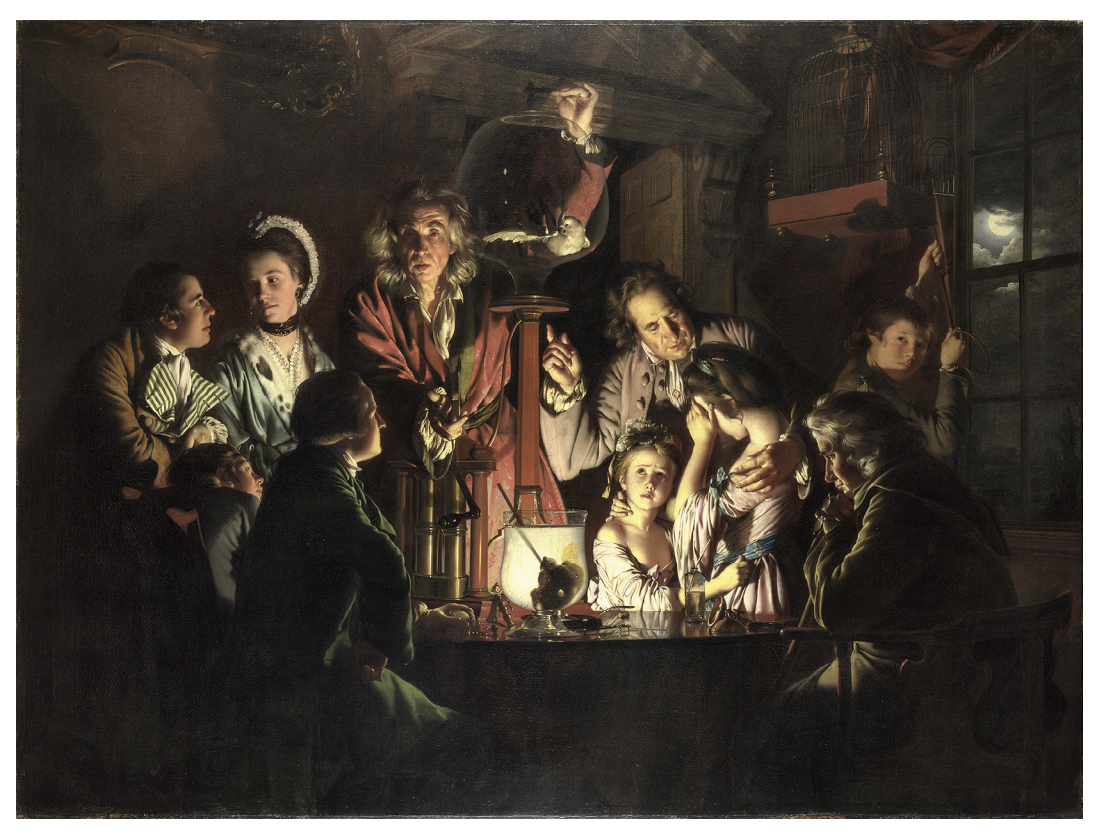
Figure 1 The painting An Experiment on a Bird in the Air Pump by Joseph Wright (1768) can be used to help students think about ethical issues that science may raise