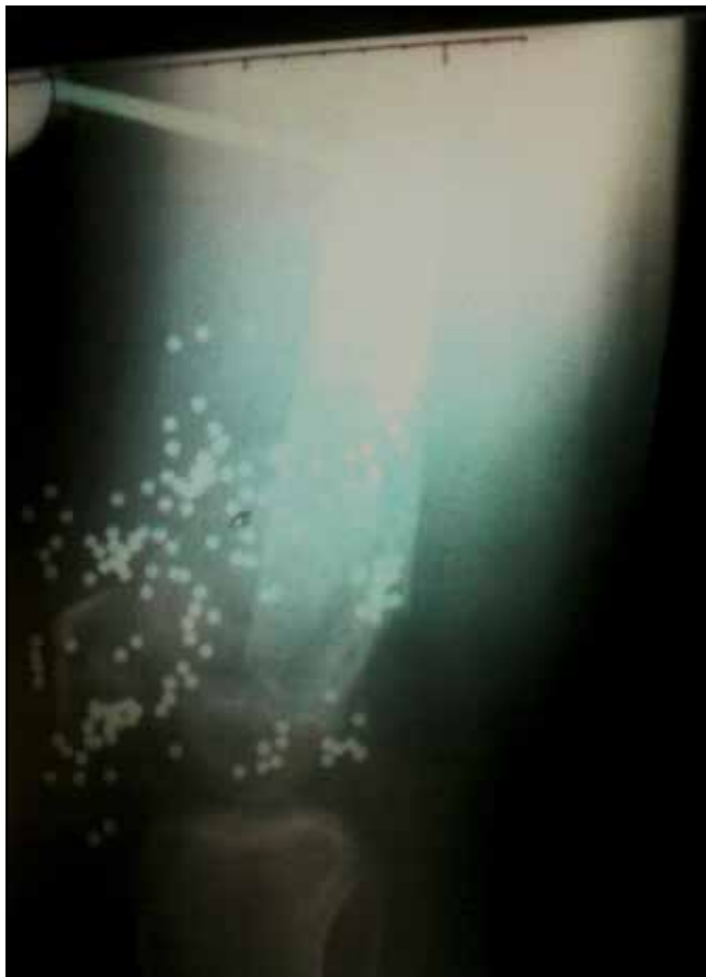
Fig 1. X-ray appearance of a shotgun wound to the leg.

The study population totalled one more victim than recorded in the 10 months preceding the 1994 ceasefire and 4 more than immediately post the 1994 ceasefire (Figure 3).