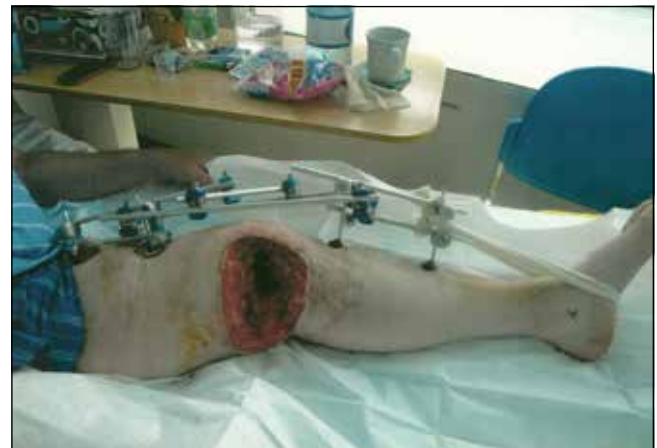
Fig 2. In-patient management of the same patient.

Adjusting for Bank of England inflation the present day total