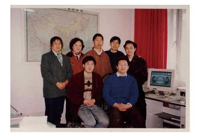
Figure 2. Youth Laboratory of Computational Biology, Wuhan Insitute of Botany, CAS (1993).

presented a new interactive classification data model (UNIC structure) to manage hierarchical classification data, and proposed a general comparison methodology for different classification trees and various types of dendrograms (Zhong et al., 1996, 1997). He also designed a prototype taxonomic database system called HICLAS (hierarchical classification system) based on taxonomic onotology (Zhong